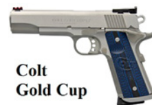
Colt Gold Cup