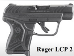
Ruger LCP 2