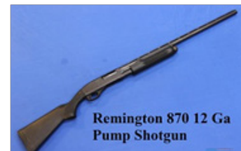
Remington 870 12 Ga Pump Shotgun