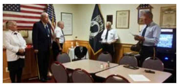
SEPTEMBER 16, 2016 POW/MIA