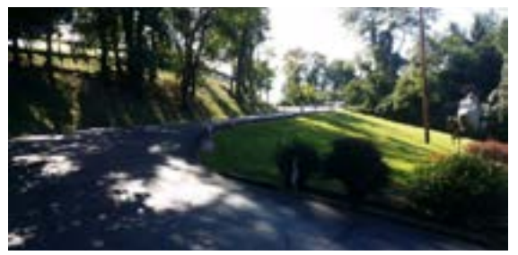
Driveway Lined with American Flags