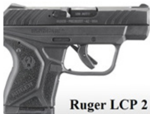
Ruger LCP 2