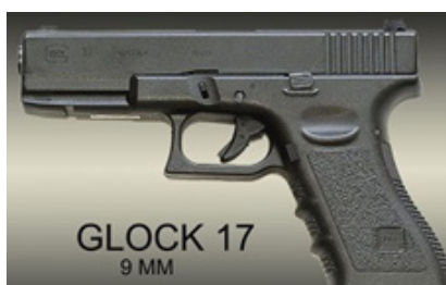
GLOCK 17 9 MM