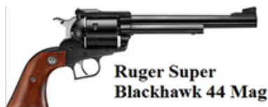
Ruger Super Blackhawk 44 Mag