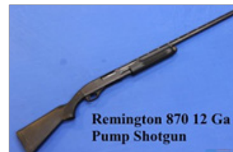
Remington 870 12 Ga Pump Shotgun