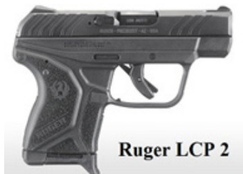
Ruger LCP 2