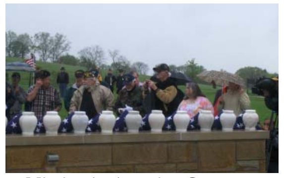
Missing in America Ceremony at the