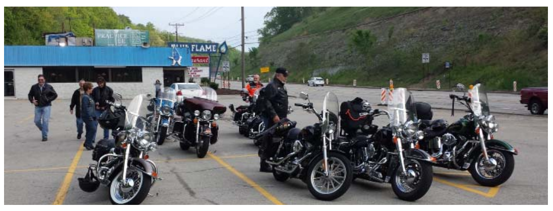
Leaving for DC from the Blue Flame