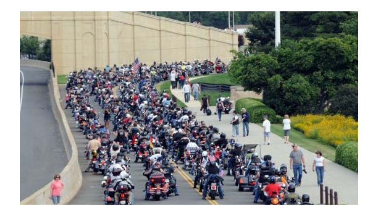
Leaving for the Pentagon