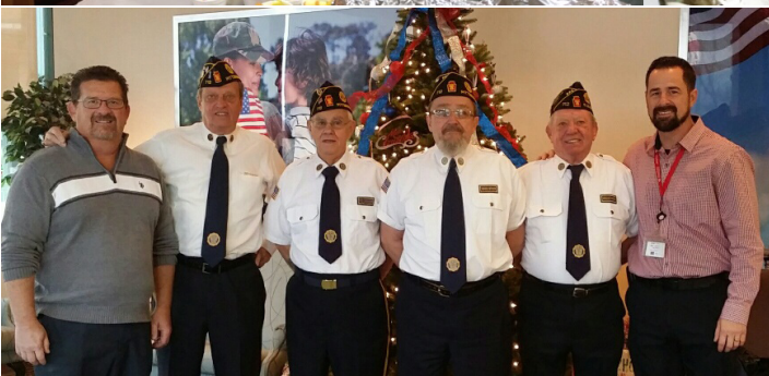
Southwestern Veterans Center