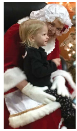
I'll sit here and watch.