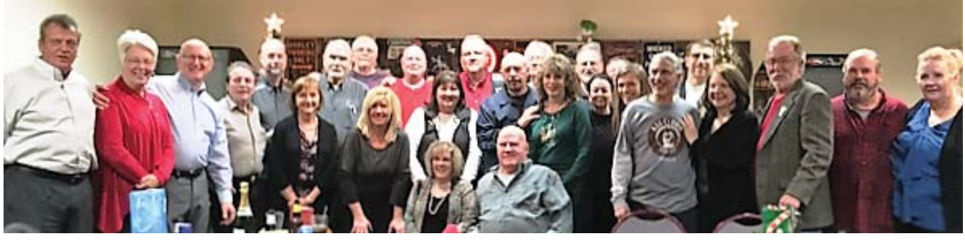
Members and guests had a really good time.