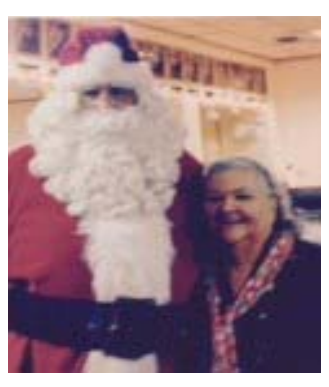
A frequent party visitor!