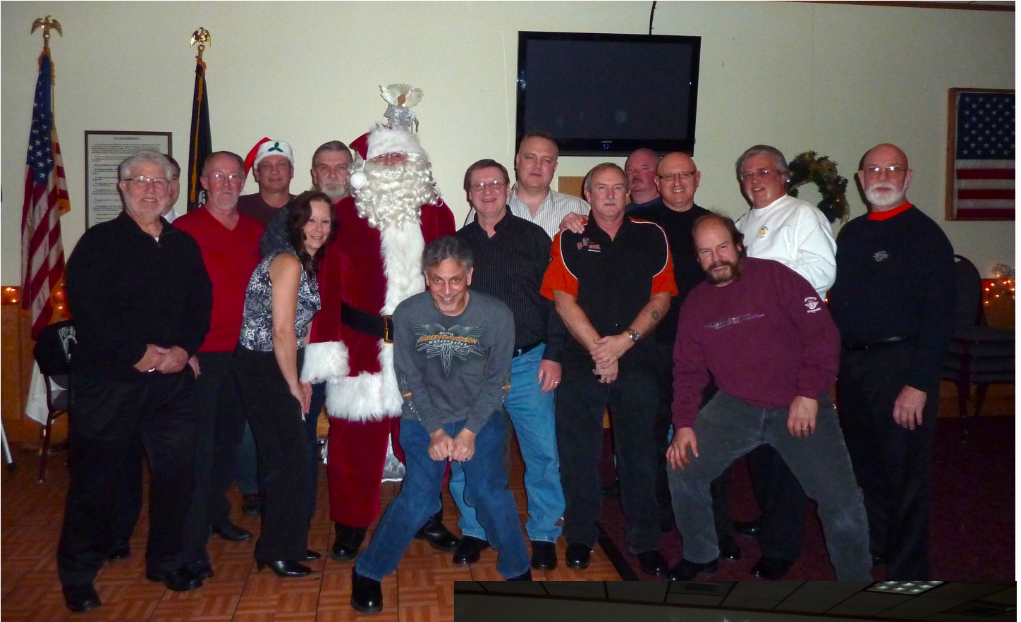
Top: The Chapter 712 American Legion Riders with Santa during 2011 Riders Christmas Party

Send to USA@ALPost712PA.org . If you have questions call 412-606-8812. Don't worry about writing, we can help with that part of the process.